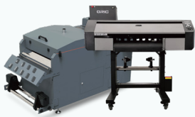
OR - 6202C DTF+D650