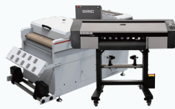
OR - 6202C DTF+H650