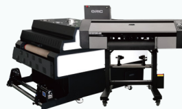
OR - 6202C DTF+DF650